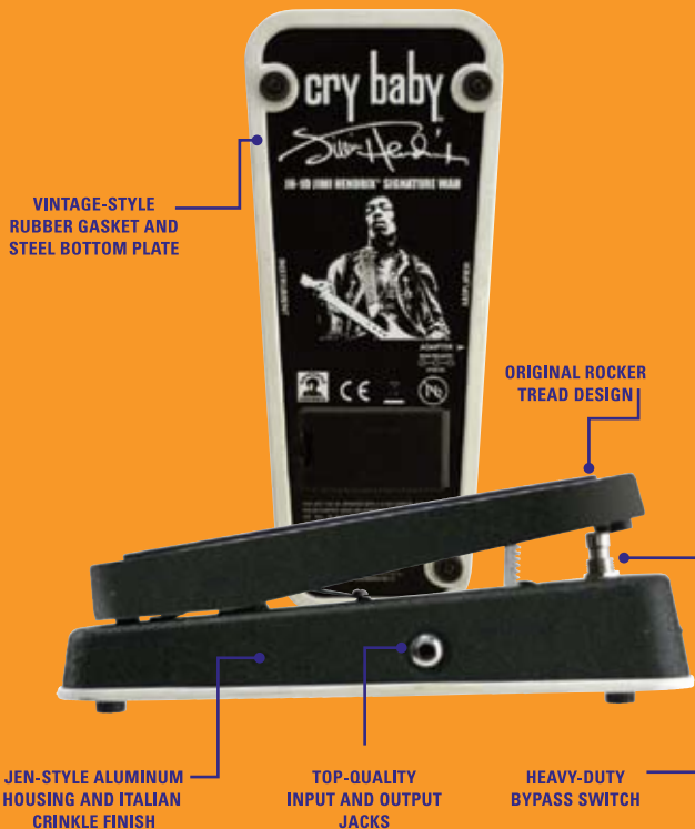
92503009/05 REV. A

©2010 DUNLOP MANUFACTURING, INC. BOX 846, BENICIA, CA 94510 U.S.A. JIMI HENDRIX IS A REGISTERED TRADEMARK OF AUTHENTIC HENDRIX LLC, USED UNDER LICENSE. WWW.JIMIHENDRIX.COM. © TM AUTHENTIC HENDRIX, LLC